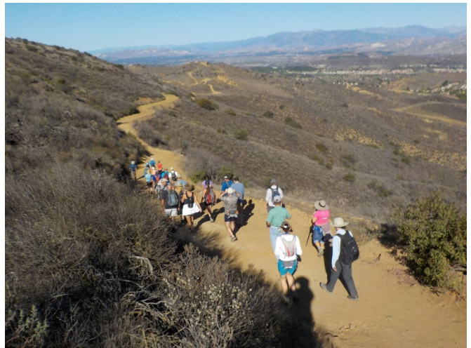
Albertson Mtwy and Long Ridge Trail