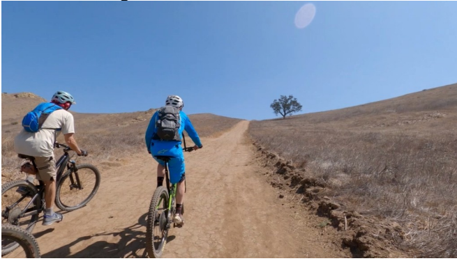
Autumn Ridge Trail